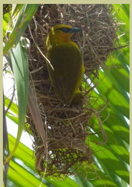
A bird near our window