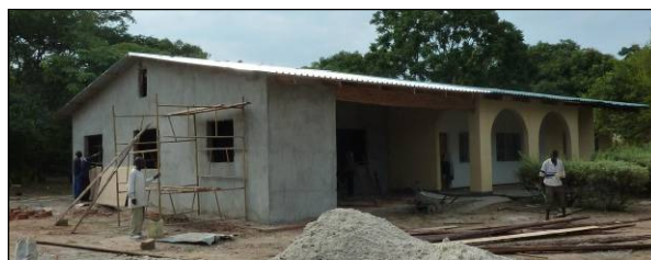
Progress on our house

Our house is making progress. The roof is on and the ceiling boards are all installed. The windows are being put in. They are even starting to paint. There is a chance we may be moved by Christmas. That would be a great Christmas gift!